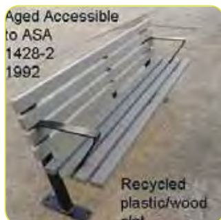
Aged Accessible to ASA 1428-2 1992