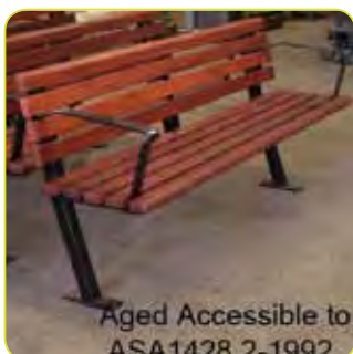
Aged Accessible to ASA1428.2-1992