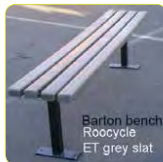
Barton bench Roocycle ET grey slat