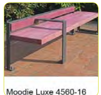
Moodie Luxe 4560-16