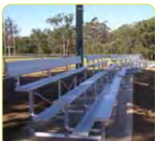
Bleacher 6m x 3 tier+backrest