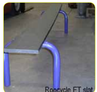
Roocycle ET slat