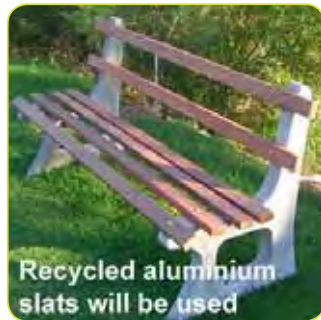
Recycled aluminium slats will be used