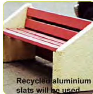
Recycled aluminium slats will be used