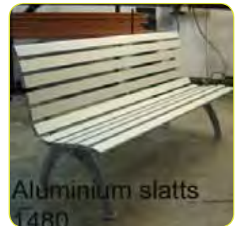
Aluminium slatts 1480