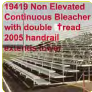
19419 Non Elevated Continuous Bleacher with double tread 2005 handrail extends to over